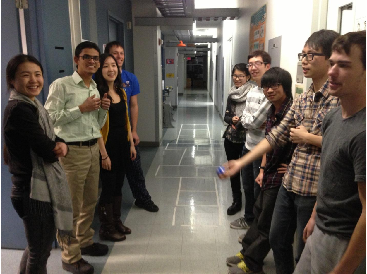
At the end of the first playtest